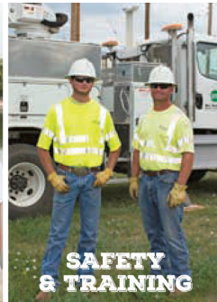
SAFETY & TRAINING