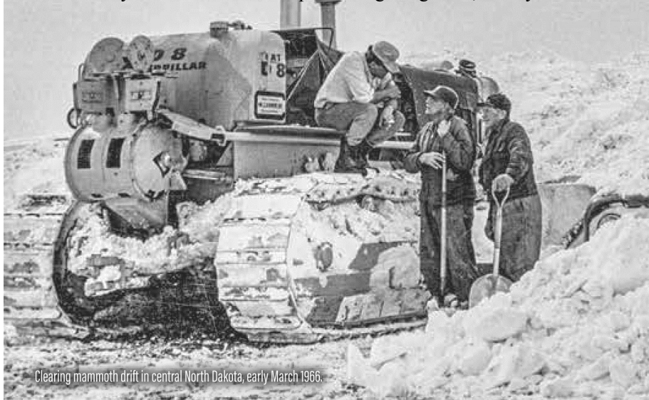
Clearing mammoth drift in central North Dakota, early March 1966.