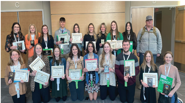
In 2023 Flasher Science Research received funds to help them make upgrades to their lab equipment.

Operation Round Up stands as a beacon of goodwill in the Mor-Gran-Sou Electric Cooperative service area. This voluntary program is where members can make a significant impact by simply rounding up their utility bills. Through this program, the Mor-Gran-Sou Electric Charitable Foundation Inc. receives vital support to enhance and uplift our local communities.